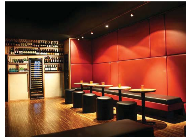
Description / Reason for this choice / Background / context